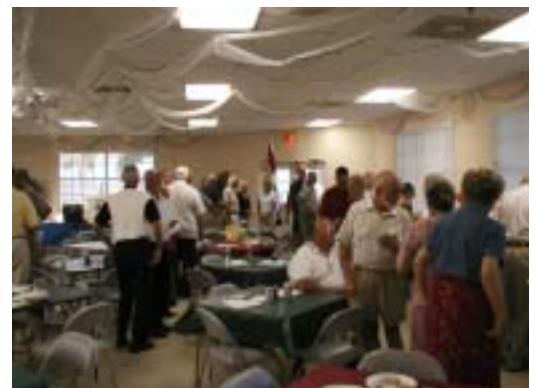
Pictured Above: Eating and Enjoying! Below: Checking out auction items.